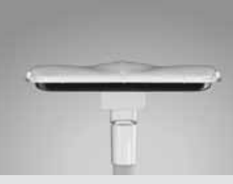
Produced under Automotive Standards.

The product LSL<sup>®</sup> 90 with 90 LED light sources has better light output characteristics at only half the consumption of energy.